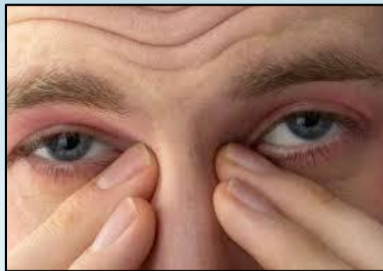
Contact lens wearers often experience dry eye during wear, especially later in the day.

1 All About Vision; Allergan Consumer Survey