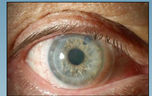
Scleral lenses vault the eye